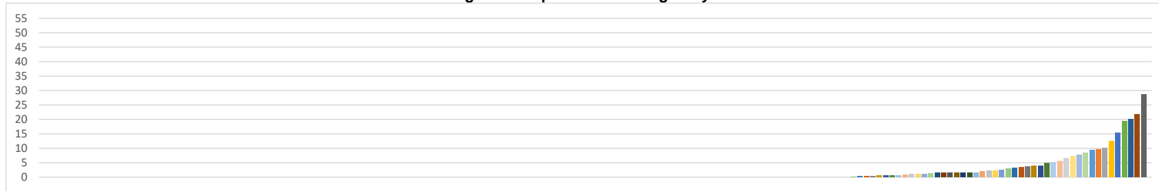
Percentage of staff placed on furlough - By landlord