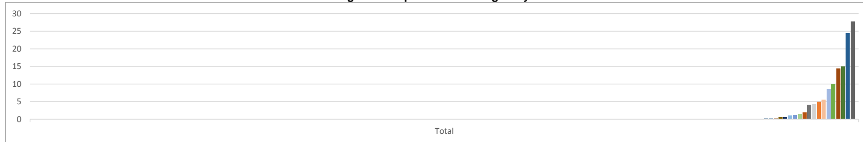
Percentage of staff placed on furlough - By landlord